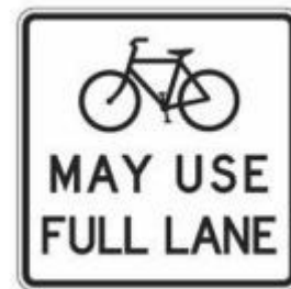
R4-11 MUTCD Manual on Uniform Traffic Control Devices